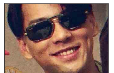
Max Mok Siu-chung

In the same year, singers Kelvin Kwan Chor-yiu and Jill Vidal were detained in Tokyo for about 20 days