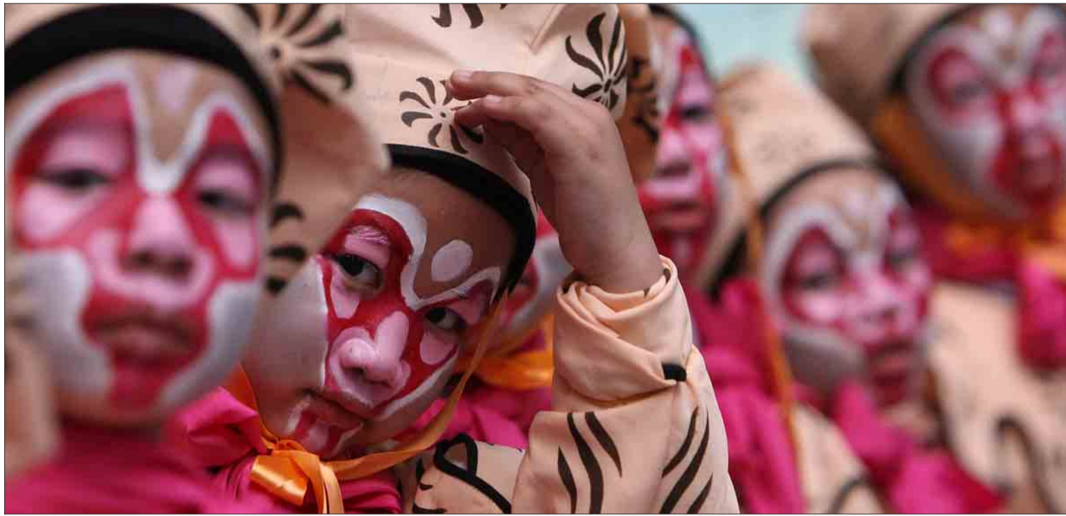
Youngsters perform in Havoc of the Dragon's Palace, based on the classic tale Journey to the West at the Academy for Performing Arts.